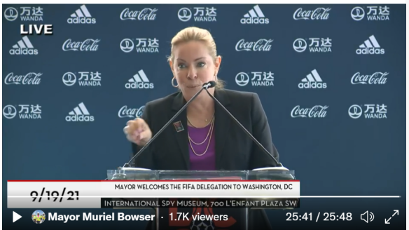
Mayor Muriel Bowser @ @MayorBowser LIVE: Mayor Bowser Welcomes the FIFA Delegation to Washington, DC